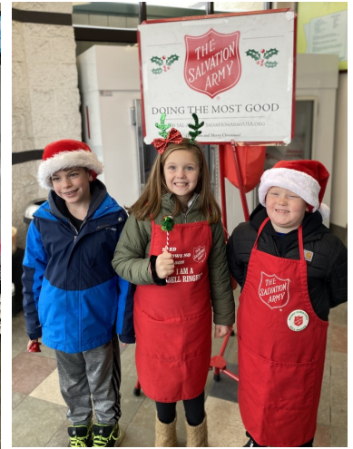
Their first community service was ringing bells for Salvation Army at Crossroads.