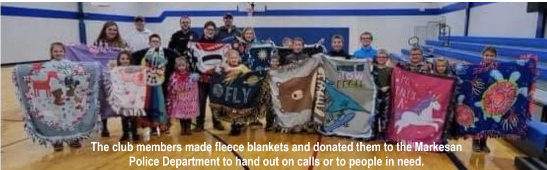
The club members made fleece blankets and donated them to the Markesan Police Department to hand out on calls or to people in need.