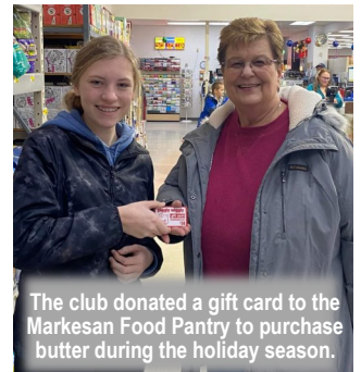
The club donated a gift card to the Markesan Food Pantry to purchase butter during the holiday season.