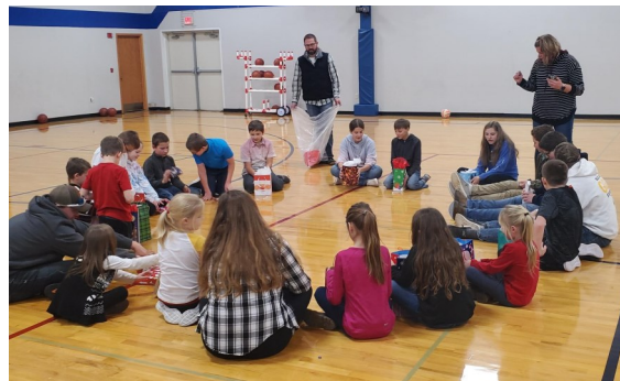
~ Christmas gift exchange between members ~