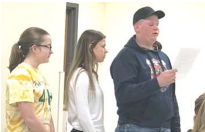
Country Clovers 4-H Club members giving their Club Report at the May 4-H Leaders' Association Meeting.