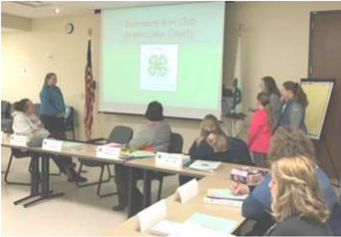
Sunrisers 4-H Club members giving their Club Report at the March 4-H Leaders' Association Meeting.