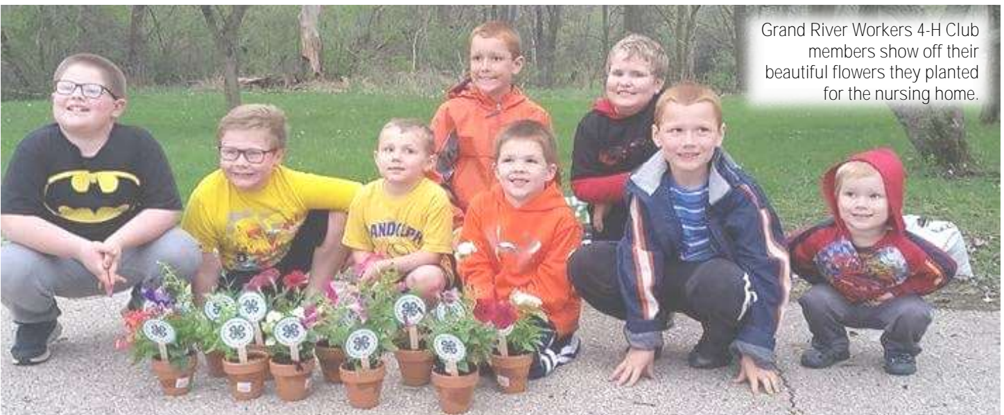
Grand River Workers 4-H Club members show off their beautiful flowers they planted for the nursing home.