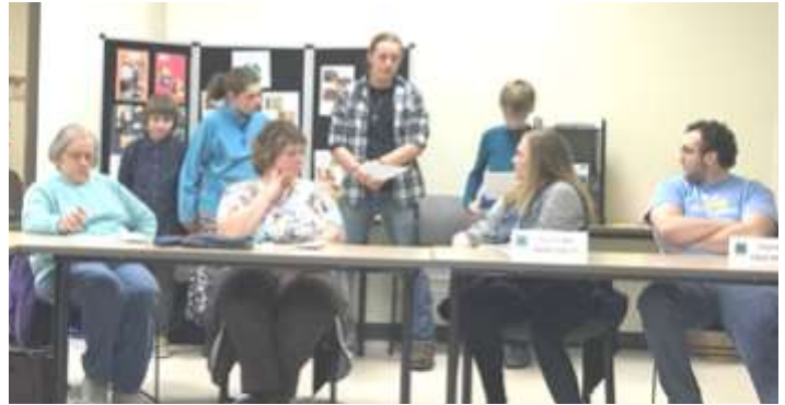
Three Hilltoppers 4-H Club members giving their Club Report at the March 4-H Leaders' Association Meeting.