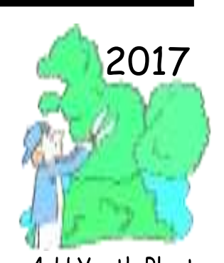
4-H Youth Plant Science Day

Plan now to participate in the State 4-H Plant Science Day event to be held Tuesday , July 11 at the Waushara County Fairgrounds in Wautoma .