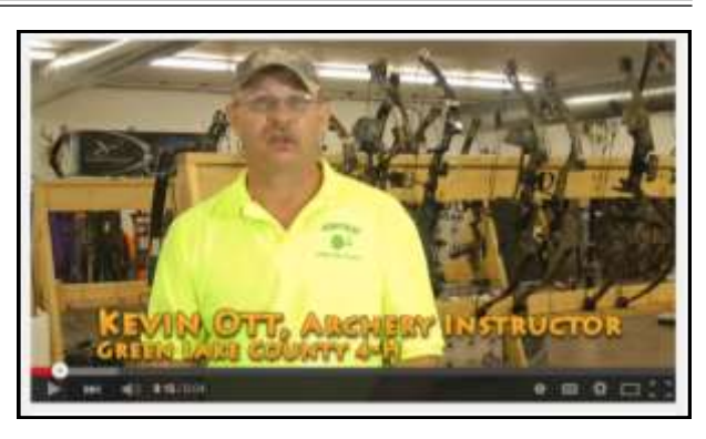
On January 23 all Archery project members were required to attend the orientation. They also viewed the Archery Safety video.