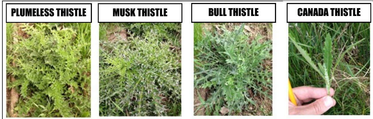
Table 1. Summary of how to differentiate between common thistles found in Wisconsin

For more complete details, see the following publications or fact sheets: “Pest Management in Wisconsin Field Crops” A3646 and “Thistles in Pastures and Beyond: Biology and Management”. UW-Extension Weed Scientist, Mark Renz is an author or co-author for these publications. His materials and research were used to create this article.